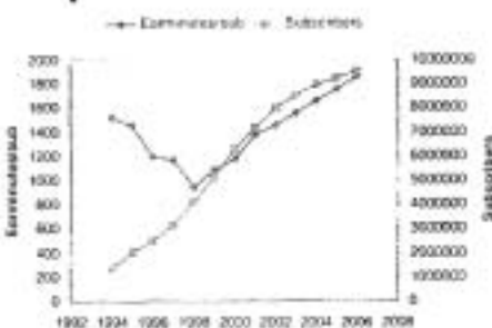
Figure 1. The graph gives the total number of mobile phone subscribers and spoken mobile phone minutes per year and per subscriber. Numbers after 2002 are estimates. The high number of ear-minutes per subscriber in 1994 is believed to be due to mainly work-related use at that time. After 1997 the private use per subscriber is also increasing.

The first mobile phones were using the analogue system called NMT. It was launched as early as 1981 and gradually came to serve almost a million subscribers in Sweden around 1994. From that time the GSM system was introduced and became very popular. Within a few years over 5,000,000 subscribers in Sweden were registered and in 2003 there were close to 8,000,000 mobile phone subscribers. Figure 1 shows the development in number of subscribers and also the average number of spoken minutes per year and per subscriber, including the receiving part in case that also is a mobile phone.