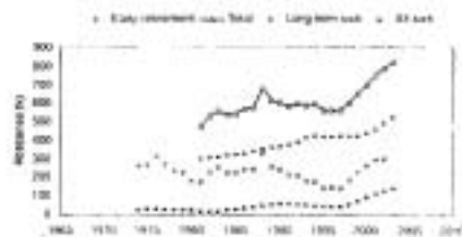
Figure 2. The development of the number of sick and long-term sick people in Sweden together with the number of early retirements show a strong increase after 1997.

The number of mobile phone minutes spent from 1981 to 1994 is an estimate since we have not got detailed information on that, except for the statement that "there was a rapid roll-out of NMT, much faster than we had anticipated" 1 .